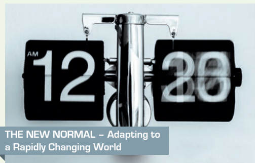
THE NEW NORMAL - Adapting to a Rapidly Changing World