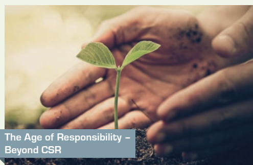
The Age of Responsibility - Beyond CSR