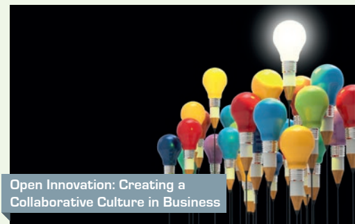
Open Innovation: Creating a Collaborative Culture in Business