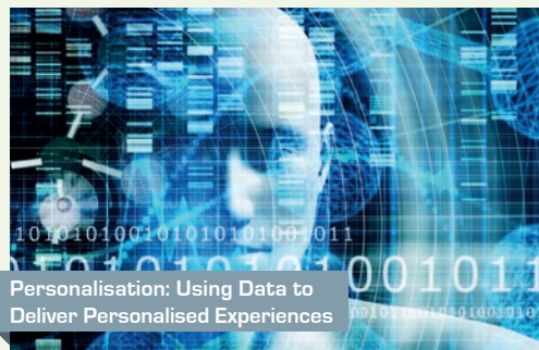
Personalisation: Using Data to Deliver Personalised Experiences