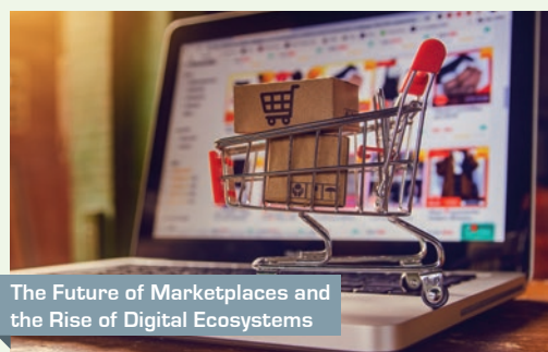
The Future of Marketplaces and the Rise of Digital Ecosystems