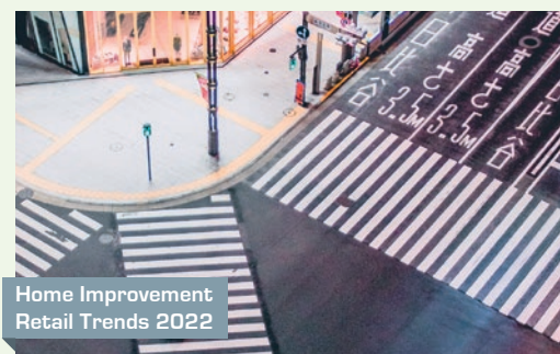
Home Improvement Retail Trends 2022